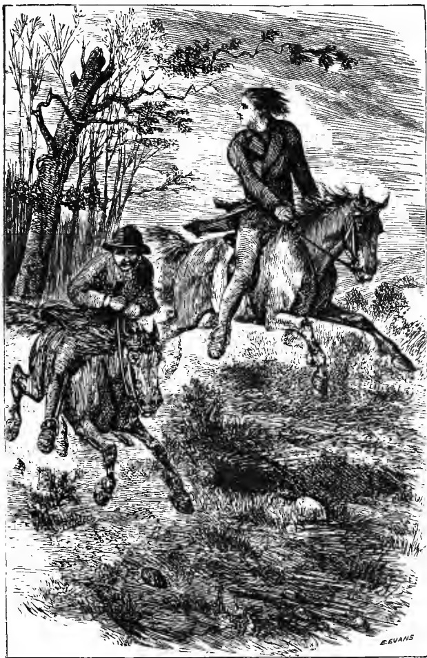
Escaping from the Castle.